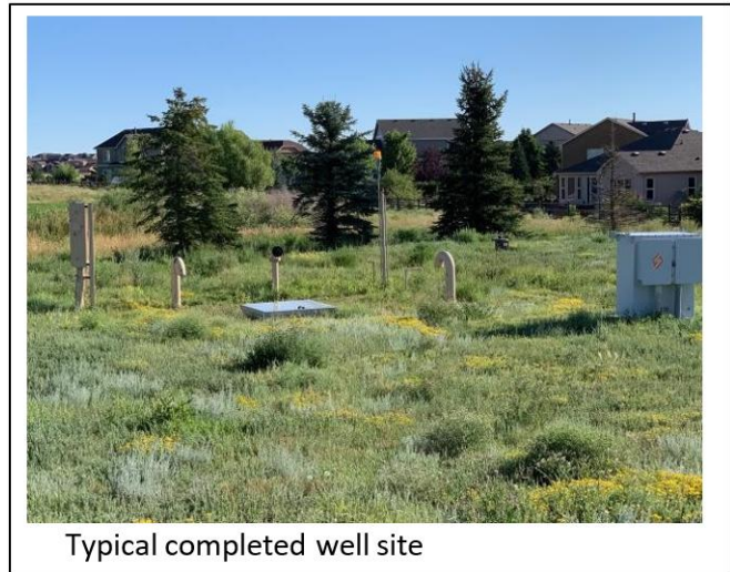
Typical completed well site

If you have specific questions or concerns about this project, please contact FAWWA at 719-452-8981 or info@fawwa.net .