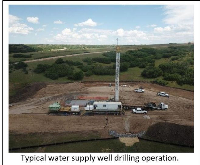
Typical water supply well drilling operation.